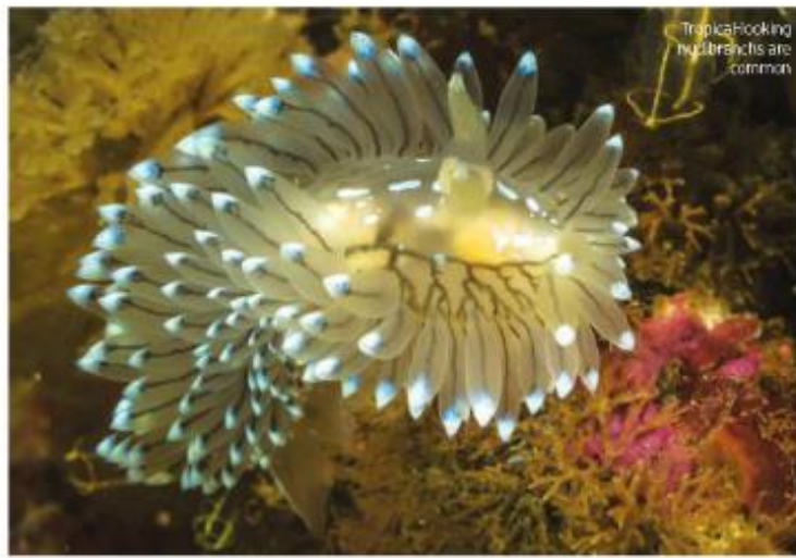
Tropical Hooking nudibranchs are common

"Small fish were darting around and with the beautiful reef, crystal water and bright white sand, this dive was stunning and I would have happily dived it all week!"