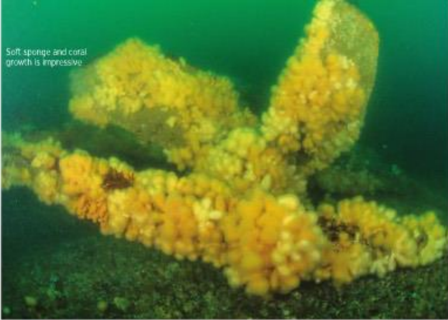
Soft sponge and coral growth is impressive