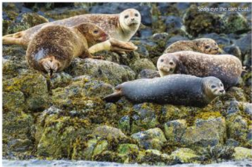
Seals eye the dive boat